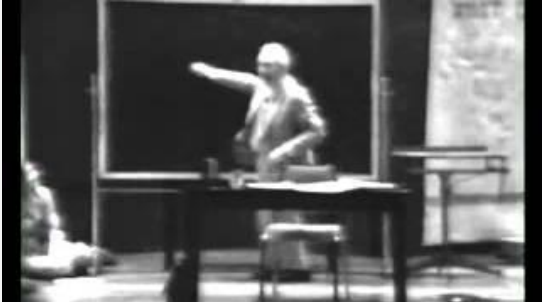
Viktor Frankl (1977): “The Unheard Cry for Meaning” Massey Hall, Toronto, Canada

Video clip: Viktor Frankl & Man's Search for Meaning Volodymyr | https://youtu.be/UgVA6nXCj1U?t=80